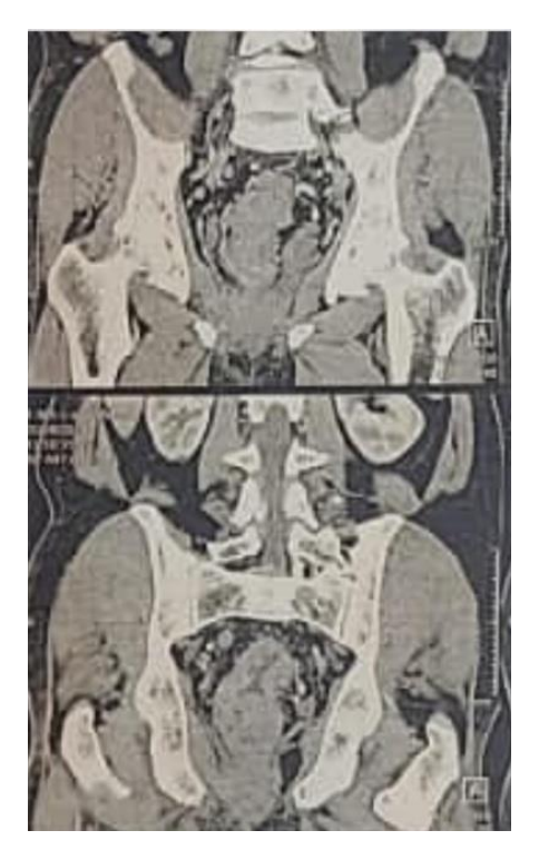
Fig. 3. Coronal section CT scan showing circumferential, irregular, stenosing rectal parietal thickening

Jahouh et al.; Asian J. Case Rep. Med. Health, vol. 7, no. 1, pp. 1-4, 2024; Article no.AJCRMH.111641