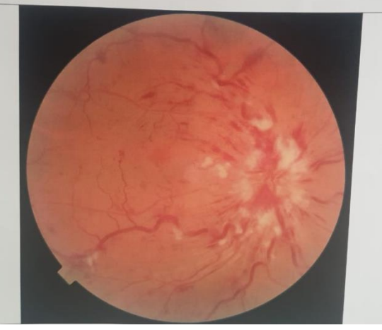
Fig. 1. et Fig. 2. bilateral retinal angiography demonstrating bilateral CRVO with stage 2 papilledema and flaming haemorrhages