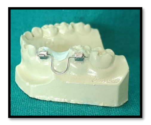
Fig. 4. SONAL'S 'U' Bonded Space Maintainer