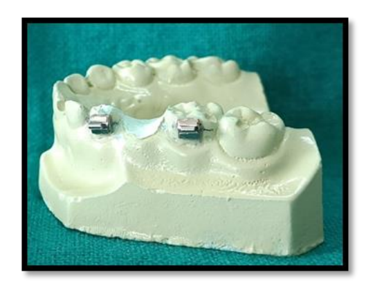
Fig. 3. Begg's Bracket