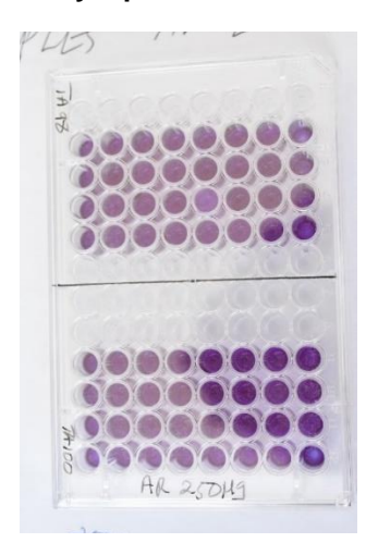
Fig. 2 b. Artavol 250µg on day 4