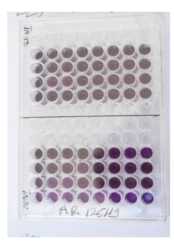
Fig. 2 a. Artavol 125µg on day 4