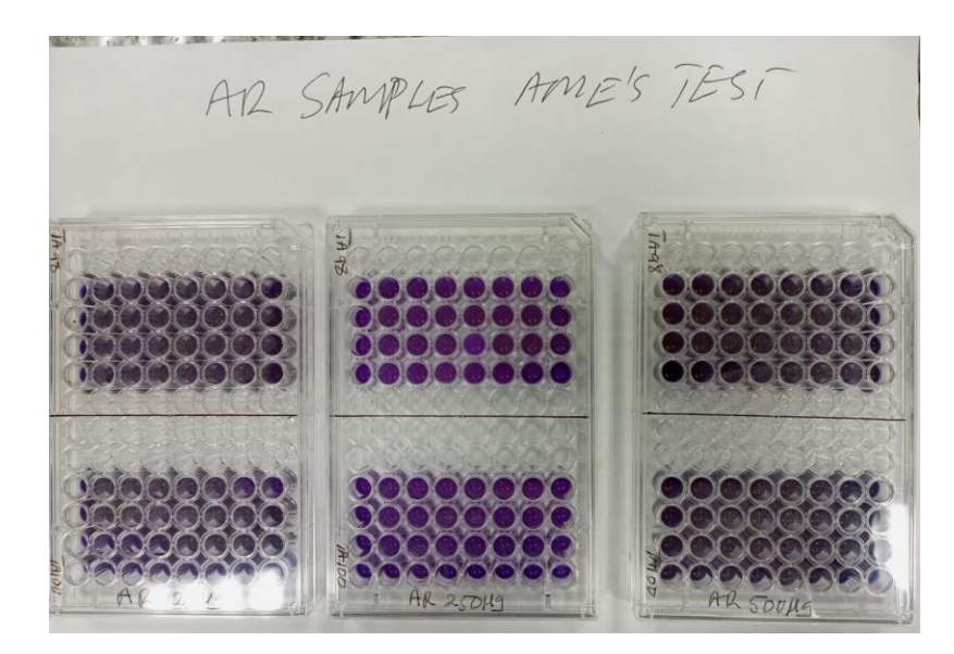
Fig. 1. Artavol® Sample 125µg, 250µg and 500µg on day 1 prior to incubation

Oloro et al.; Euro. J. Med. Plants, vol. 35, no. 3, pp. 33-41, 2024; Article no.EJMP.116316