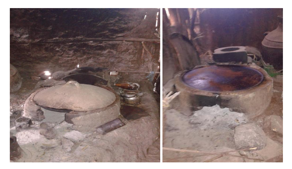
Fig. 2. Mirt fuel-efficient stove