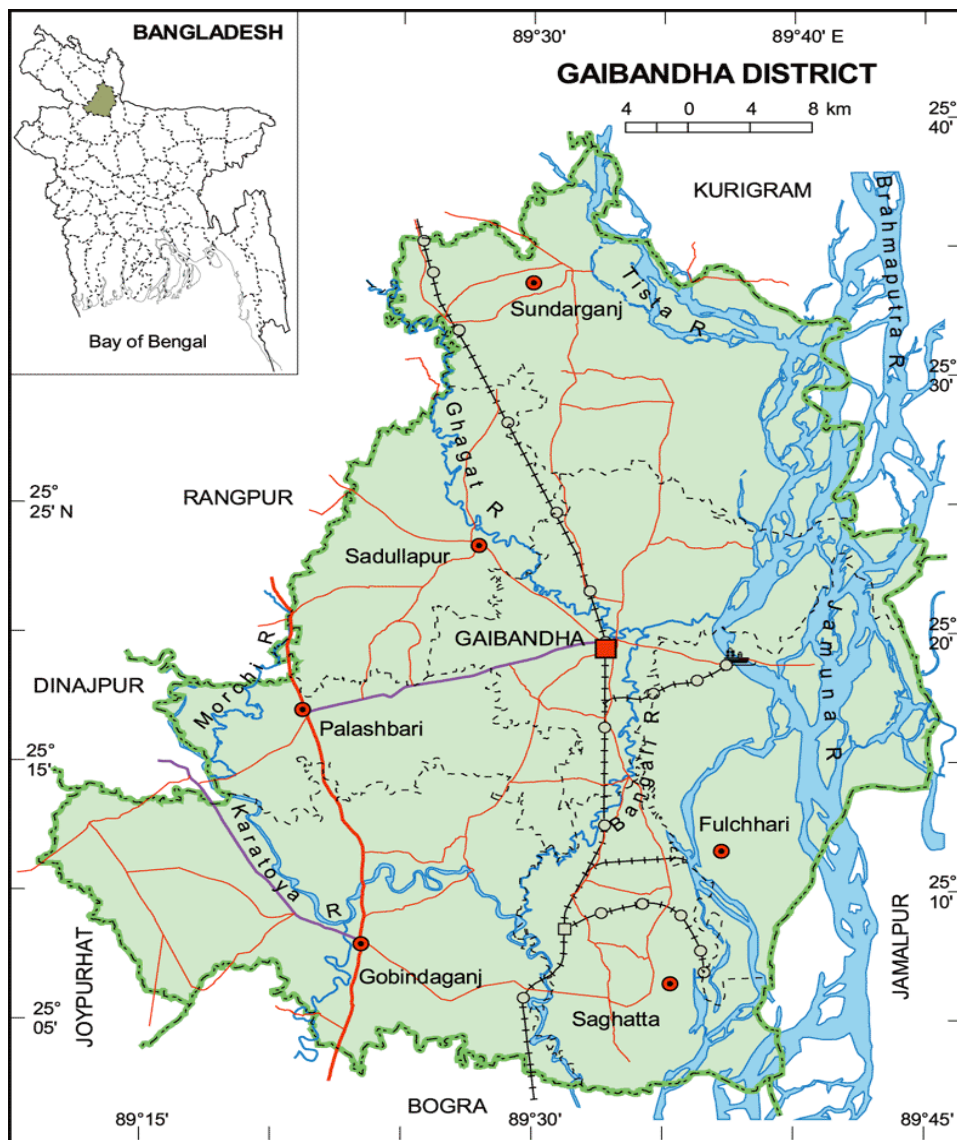
Fig. 1. A map of Gaibandha district showing study location

Where, total cost implies the cost of all inputs including cultural, intercultural and post-harvest operation and other expenses. Gross return represents the market value of harvested grain and straw of BUdhan1.