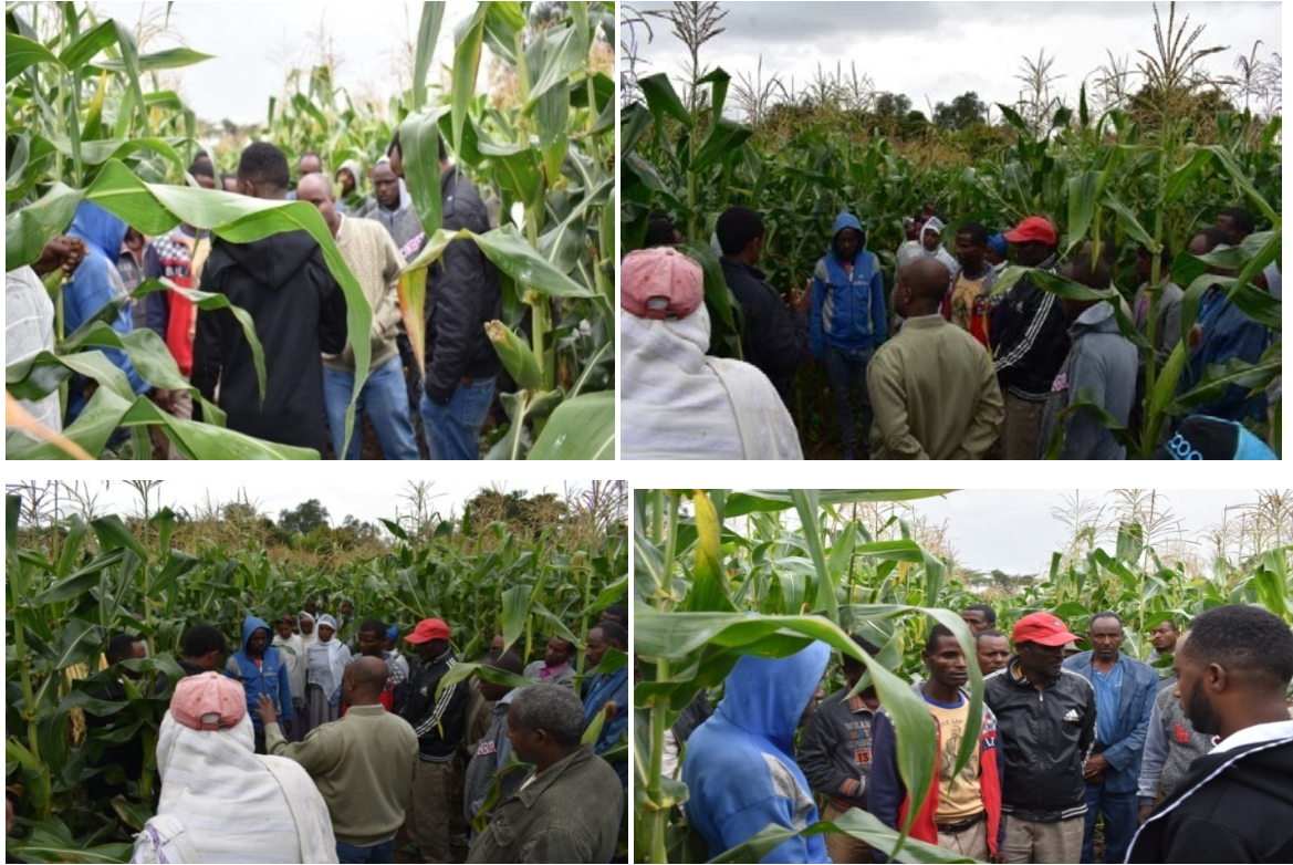
Figure 3. Min-Field day at Dugda woreda,2018 crop season.