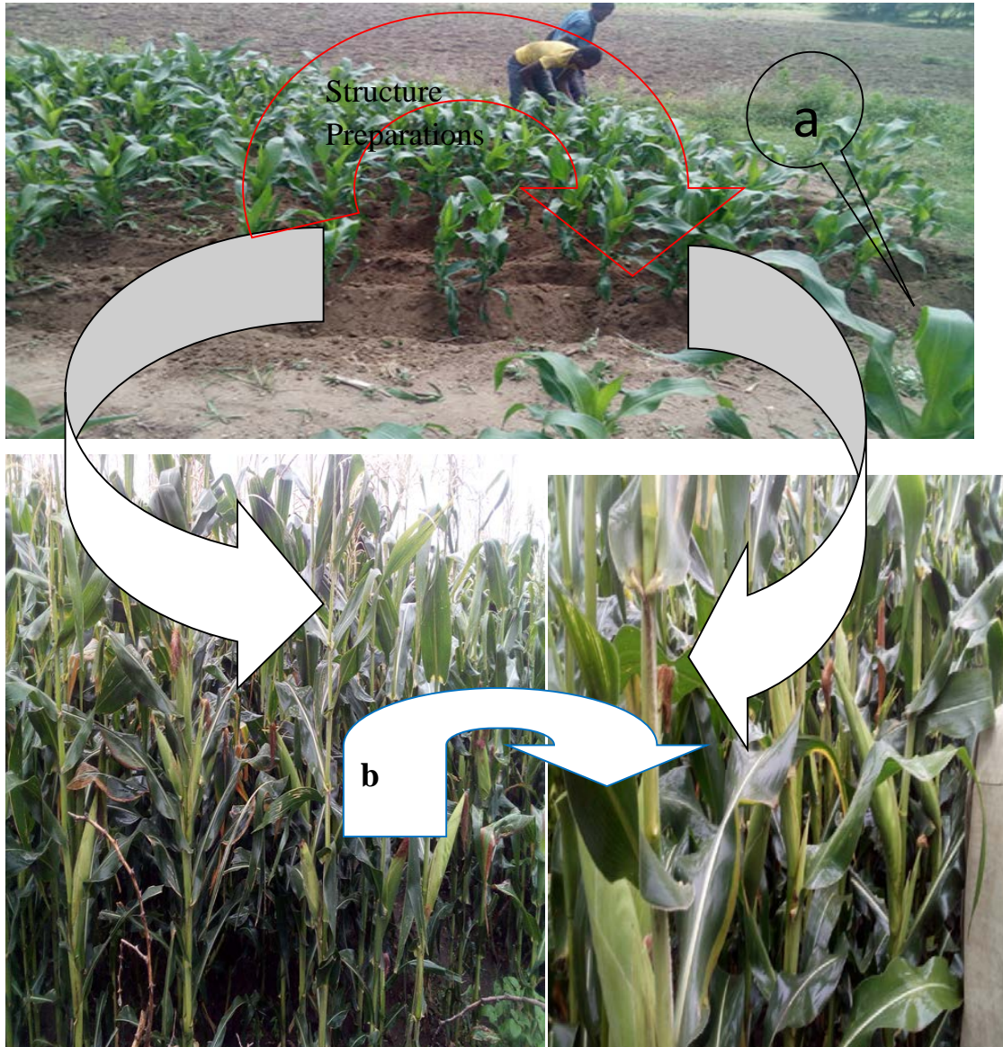
Figure 2. Preparation of in situ moisture conservation structure (a) and status of maize crop (b).

and expressed as \text{ton ha}^{-1} . The plant stand counts and number of cobs (heads) per hectare were determined by counting the number of plants in the net area for the three rows ( 2.25 \text{ m} \times 10 \text{ m} ). Thousand weight of seeds was determined by counting thousands seed dry seeds and their weight are recorded in grams.