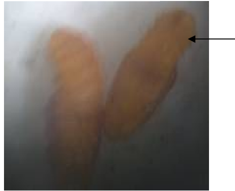
Plate 7. Male and Female pupa of C. elaeidis (X100) (Female is bigger: right arrow)

The pupa is dark brown and covered by a thin, soft cuticle. There is no feeding and it appears inactive. The female pupa was observed to be bigger (Plate 7).