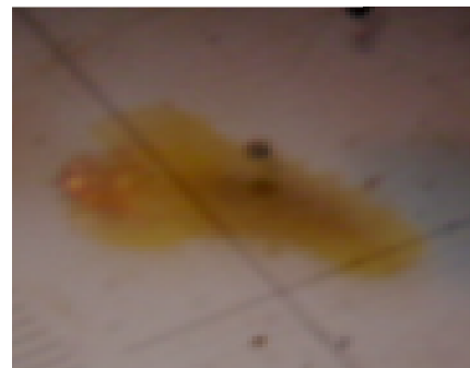
Plate 3. First instar larva (X100)

The first instar larva is creamy yellow (Plate 3).