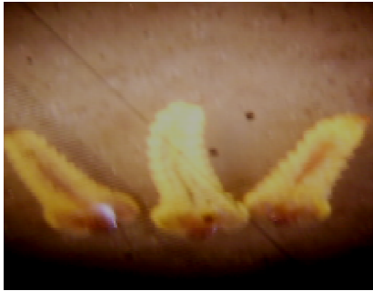
Plate 4. Second instar larva (X100)

The second instar larva is creamy yellow with the beginning of darkening at the abdomen (Plate 4).