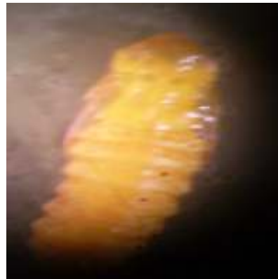
Plate 8. Pupa emerging to adult (X100)

Adults emerge from the pupa stage by pulling itself out from their old skins. It was observed that emerging pupa to adult move away from light source. Observation showed that the pupation process from pupa to adult is from the head and wings, and extending to other parts (Plates 8, 9 and 10).