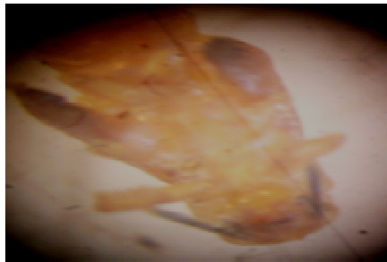
Plate 9. Pupa prior to adult emergence (X100) (ventral surface)