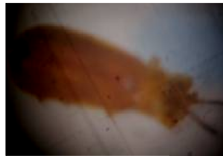
Plate 11. Adult (X100)

biting off leaf tissue and scraping leaf surface. A pair of compound eyes is present. The paired antenna length measured 0.6–0.9 mm. It's blackish in color with horizontal striations. The thorax is made up of rigid, hardened plates. The abdomen consists of 8–10 segments. Three pairs of legs are present measuring 1.0–1.3 mm. It has two pairs of wings present with a membranous system of veins running through out. Its length measures 1.8–2.2 mm.