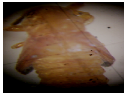
Plate 10. Pupa prior to adult emergence (X100) (dorsal surface)

Their flights are of short duration and their darting movement makes it difficult to follow their course with the eye. They were usually less active with approaching higher temperatures in the afternoon. They were usually observed feeding next to each other. The adult C. elaeidis head is made up of heavy, muscular and circular reddish cranium with mouth parts adapted for