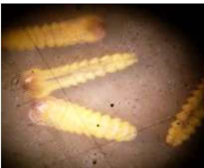
Plate 6. Fourth instar larva (X100)

The fourth instar larva is light brown with a better developed head region (Plate 6).