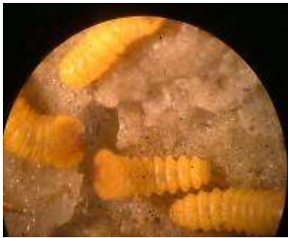
Plate 5. Third instar larva (X100)

The third instar larva is light brown (Plate 5).