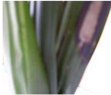
Plate 2. Leaflets removed from rearing cage indicating egg laying and hatching in the leaflets (X100)

at this phase. Increase in size was most pronounced with resultant molting. They are light brown with increasing darkening pigmentation until the 4 th instar stage. They lack compound eyes, possess reduced antennae and lack external evidence of wing formation. However, they possess a well developed head and mouthparts adapted for biting. They feed well on artificial diet in the laboratory. However, they were found to thrive in the mined crevices of damaged and infested oil palm leaves. Plate 2 show leaflets indicating egg laying and hatching.