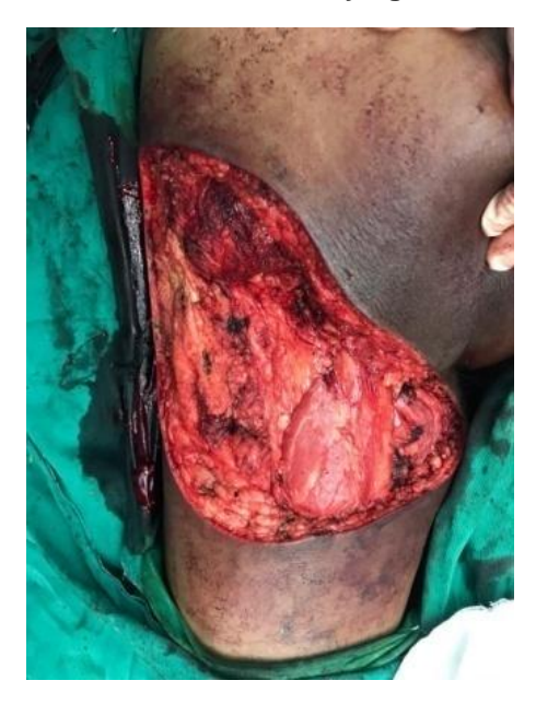
Fig. 3. Intra operative image showing the tumour bed