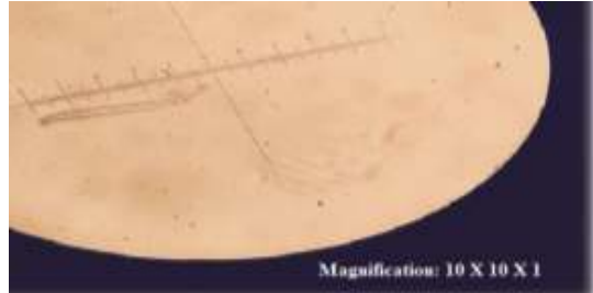
Fig. 5. View of the setae through Microscope