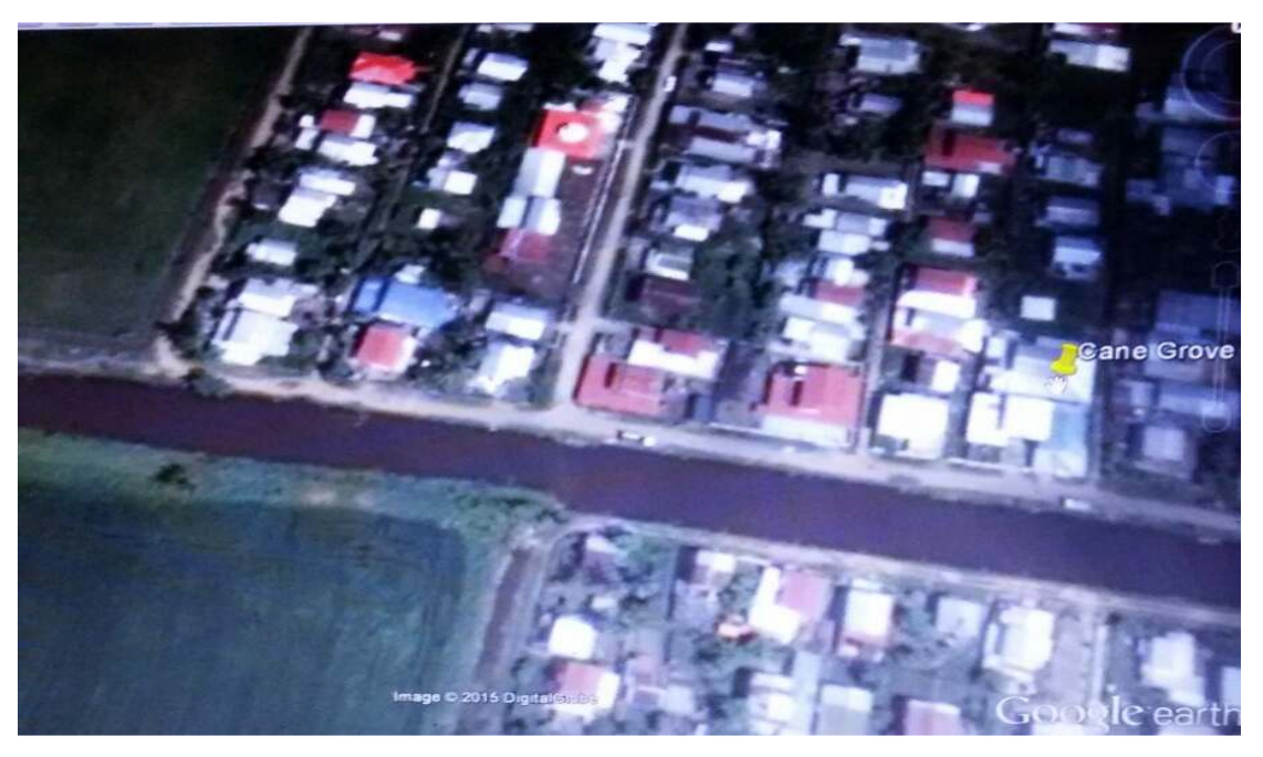
Fig. 1. Aerial view of study area (picture taken from Google earth)

Jaikishun et al.; ARRB, 8(6): 1-7, 2015; Article no.ARRB.22573