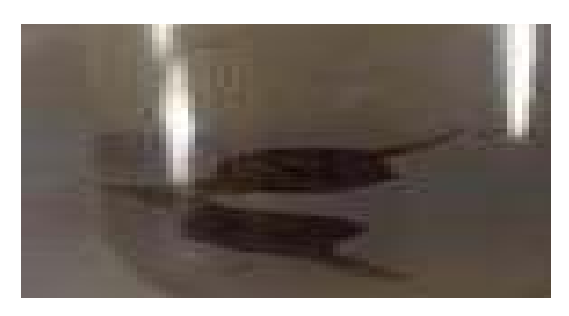
Fig. 6. Lemon-shaped cocoons