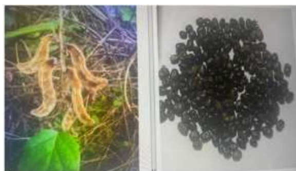
Plate 2. Mucuna pruriens dry pods and Mucuna pruriens dry seeds

the Solanaceae family that is well reputed to possess toxic tropane alkaloids [20, 21, 22].