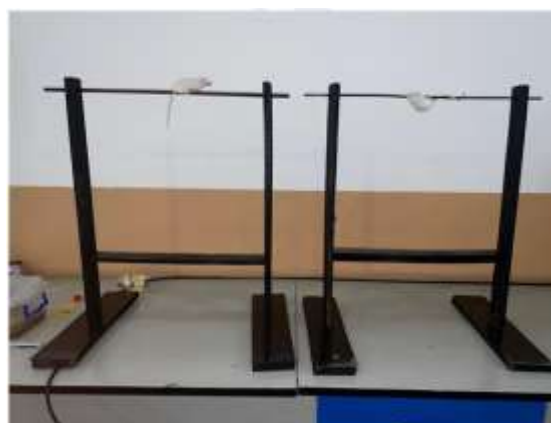
Plate 6. Two units of Beam (rod) walking test apparatuses with 2-mm and 4-mm iron rods

given an oral treatment by gavage with distilled water (DW) 10 ml/kg, AETGL1500 mg/kg, AEMPS 1500 mg/kg, AEDML 750 mg/kg, AEDMS 750 mg/kg, or tramadol 133 mg/kg followed 30 minutes later with oral treatment of diazepam (DZ) 40 mg/kg. Sleep onset was taken as the time gap between last oral treatment and total loss of righting reflex, while sleep duration was taken as time gap between the total loss and full return of the righting reflex in the experimental mice (Plate 4).