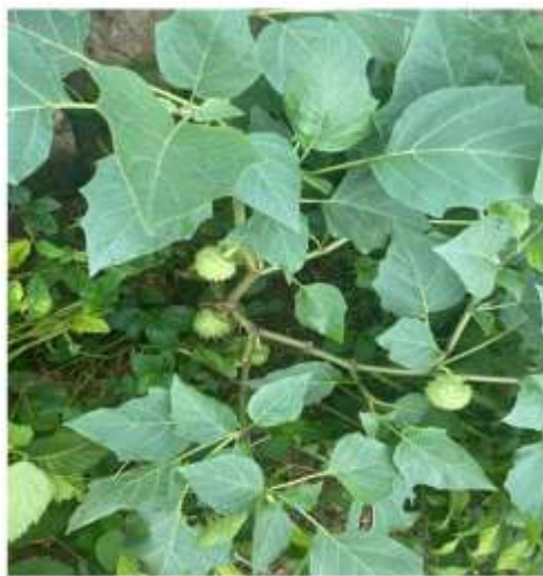
Plate 3. Datura metel (Thornapple, Jimson weed) with maturing fruits

amnesia disorientation, schizophrenic symptoms, coma and even, fatalities [32-37]. However, despite the above-highlighted ethnomedicinal, psychoactive therapeutic and toxic effects, scientific assessment of the neuro-behavioural fallouts of accidental/intentional ingestions of high doses of DM is sparse. The aim of this study therefore is to evaluate the neuro-behavioural toxicity potential of single high doses of DM seed/leaf extracts in mice.