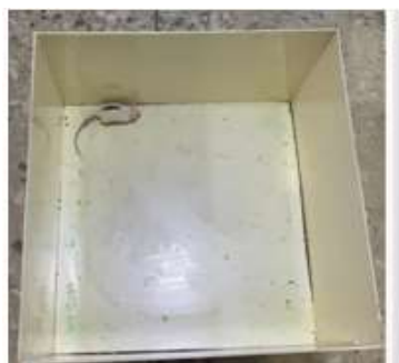
Day 1. Plain open field maze

Briefly, on the first day of the 2-day protocol, experimental mice were each trained to familiarize with the test environment and device by being gently dropped in the middle of the apparatus and allowed to freely explore the test environment for 10 minutes, and then returned to the home cage. The second day i.e., the test day mice were each individually re-exposed to the apparatus, but this time around with two similar colourless plastic containers cut in half - with the cut ends plastered to the floor at opposite corners within the test apparatus. The mice were allowed to freely explore the environment for 10 minutes - with only those which explored each of the plastic objects for a minimum of 20 seconds of the test period deemed to have met inclusion criteria for the main cognitive test. Subsequently,