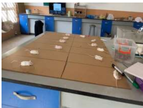
Plate 5. Experimental mice at different phases of hypnosis

The photocells are coupled to a digital counter which records a count when each animal interrupts the horizontal light beams as it moves within the closed chamber either spontaneously or as facilitated by the non-injurious electric currents in the chamber's floor rod grid lines. A current of 20 volts was used throughout this assay. Briefly, healthy mice (20 – 25 g; both sexes) were randomized into 7 experimental groups I – VII (n = 6) and were each individually introduced into the test chamber of the actophotometer for 10 minutes and a basal activity was recorded for each mouse. An experimental group was subsequently given oral treatment of distilled water 10 ml/kg, aqueous methanol TGL 1500 mg/kg, aqueous methanol MPS 1500 mg/kg, aqueous methanol DML 750 mg/kg, aqueous methanol DMS 750 mg/kg, aqueous tramadol 133 mg/kg, or aqueous diazepam 2 mg/kg. 1 hour following their respective treatments mice were each re-exposed to the test for 10 minutes and their activities were recorded by the device's digital counter. The counter was stopped at the end of each trial for tested mice and was re-set before the next trial. The basal and post-treatment activities for each mouse were compared and the percentage reduction or increase in activity was recorded in a way that each animal acted as its own control.