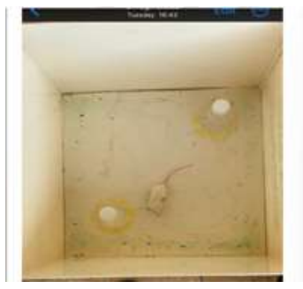
Day 2. Open field with similar objects