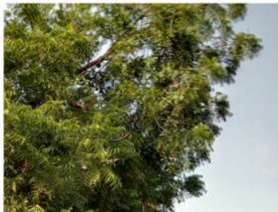
Plate 1. Tapinanthus globiferus parasitising Azadirachta indica (Neem) tree

comprising over 100 species [14,15]. The seed extracts of this medicinal plant have been credited with ethnomedicinal efficacy in male infertility, snake bites, nervous disorders, Parkinson's, and related neurodegenerative diseases [14-16].