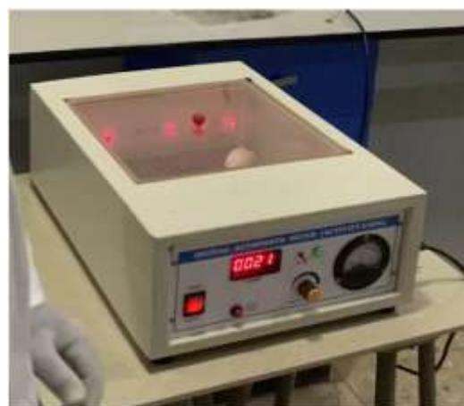
Plate 4. Department of Pharmacology & Therapeutics, U,of A. Actophotometer with a mouse in-situ

The evaluation of the effect of single high oral doses of extracts and drugs on the locomotory activity (an index of wakefulness/alertness of the mental state) of mice was carried out using a digital actophotometer according to the protocol adopted by Sugumaran et al., 2008 [52] with minor modifications. An actophotometer is a square or circular chamber which consists essentially of 5-6 horizontal light beams from one side of the chamber onto a set of photocells situated on the opposite side, a floor embedded with rod grid lines through which varying degrees of electric (0 – 100 volts) currents are passed, and a glass seal at the top of the device for introducing the experimental animals into the chamber.