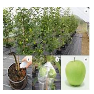
Fig. 6. Greenhouse