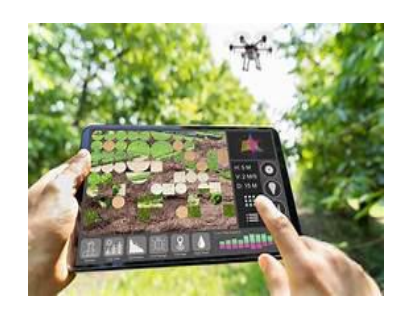
Fig. 7. Precision farming