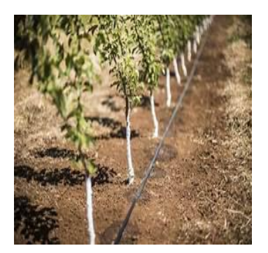
Fig. 2. INM