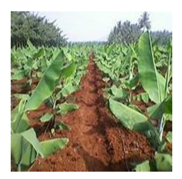
Fig. 4. Fertigation