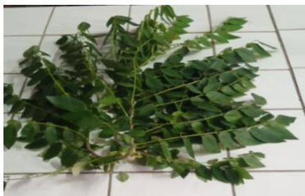
Fig. 1. Gliricidia. sepium leaves (Jacq.) Kunth ex Walp