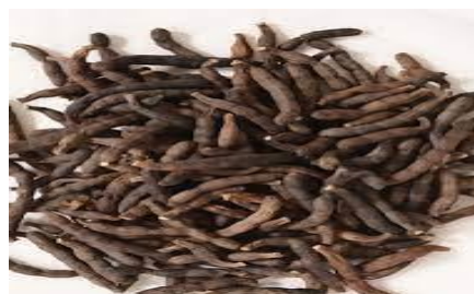
Fig. 2. Xylopia. aethiopica fruits (Dunal) A. Rich

(100 g) of plant powder were dissolved in one liter of hydroalcoholic solvent comprising 70% ethanol and 30% distilled water. The mixture was then homogenized 10 times at the rate of 2 minutes per revolution using a mixer. The homogenate obtained was drained in a square of fabric then filtered successively three times on hydrophilic cotton and then on Whatman paper (3 mm). The filtrate was evaporated at 45°C in an oven for 48 hours. The dry powder obtained constituted the 70% ethanolic extract.