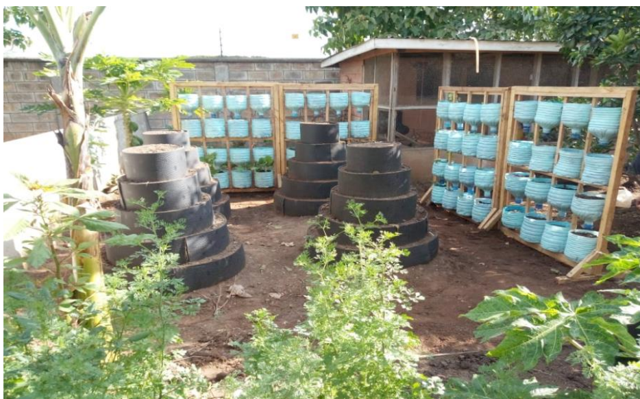
Fig. 2. Vertical farm in Africa

“Vertical farming companies have arisen in all of the main Brazilian metropolises, says Italo Guedes, a crop and soil scientist at Embrapa. In the last three years there has been an increased demand for information about vertical farming and the opening of several farms in Brazil. Brazil has abundant land resources and vegetable production is more strongly limited by climatic conditions than land availability. Tropical regions present significant challenges to vegetable crop production, especially with the increased frequency of extreme weather events”. “Brazil's green belts are located in proximity to urban centers, but this production model may already be exhausted and is clearly under threat. By bringing vegetable production indoors, Brazilian growers can avoid the climatic challenges of growing in a tropical region while bringing food production even closer to the consumers. Vertical farms will play an important role in Brazil in reducing post-harvest losses of vegetables and in increasing the local consumption of fresh, nutritious food by the urban population. These farms also consolidate concepts of bio-economy and circular economy. The growth of agriculture in a controlled environment makes clear the need for investment in science and technology for sustainable agriculture”.