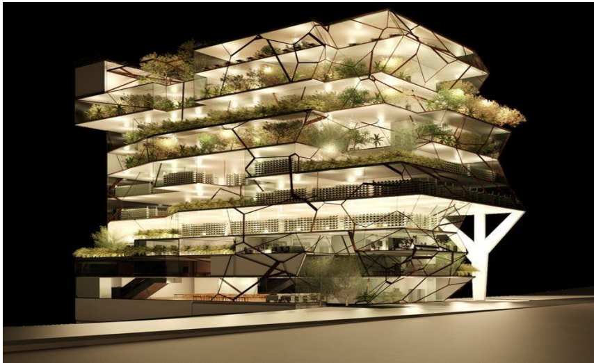
Fig. 3. Vertical farm in Sao Paulo, Brazil