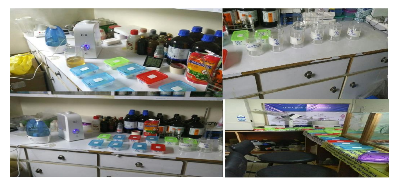
Figure 1. Picture representing the contact and ingestion bioassay method using small plastic boxes at recommended field dose of neonicotinoid insecticides

Neonicotinoids (imidacloprid and clothianidin) also effect on foraging activity of bees and longtime flight ability of forager even with sub-lethal doses (Schneider et al., 2012). Colony collapse disorder called CCD is also associated with neonicotinoids. Research showed that thiamethoxam can detract foragers and reduce their ability to return their hives. This can lead high mortality and put colony at CCD danger (Henry et al., 2012). Most widely used insecticide from this group is imidacloprid and is associated for the reduction of vitellogenin called egg volks that regulate bee's development (Abbo et al., 2017). Examination of different body parts of honeybee after exposure with imidacloprid showed that residues found in various body parts midgut, head abdomen etc. of honeybee (Suchail et al., 2004). Previous study also showed that neonicotinoids especially imidacloprid effect on memorizing ability of honeybees and this lead abnormal foraging ability during flower visiting (Decourtye et al., 2004; Yang et al., 2008).