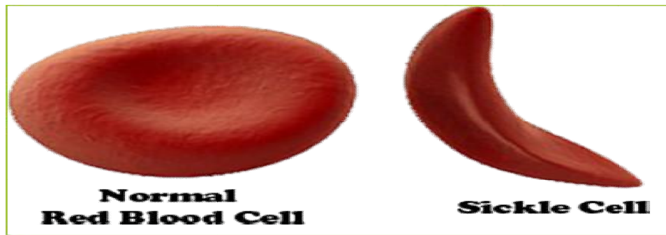
Fig. 1. Visual representation of normal blood cell and sickle cell

SCD is mainly caused by a mutation in the sixth codon of the \beta -globin gene on chromosome 11 that leads to a single amino acid substitution [4].