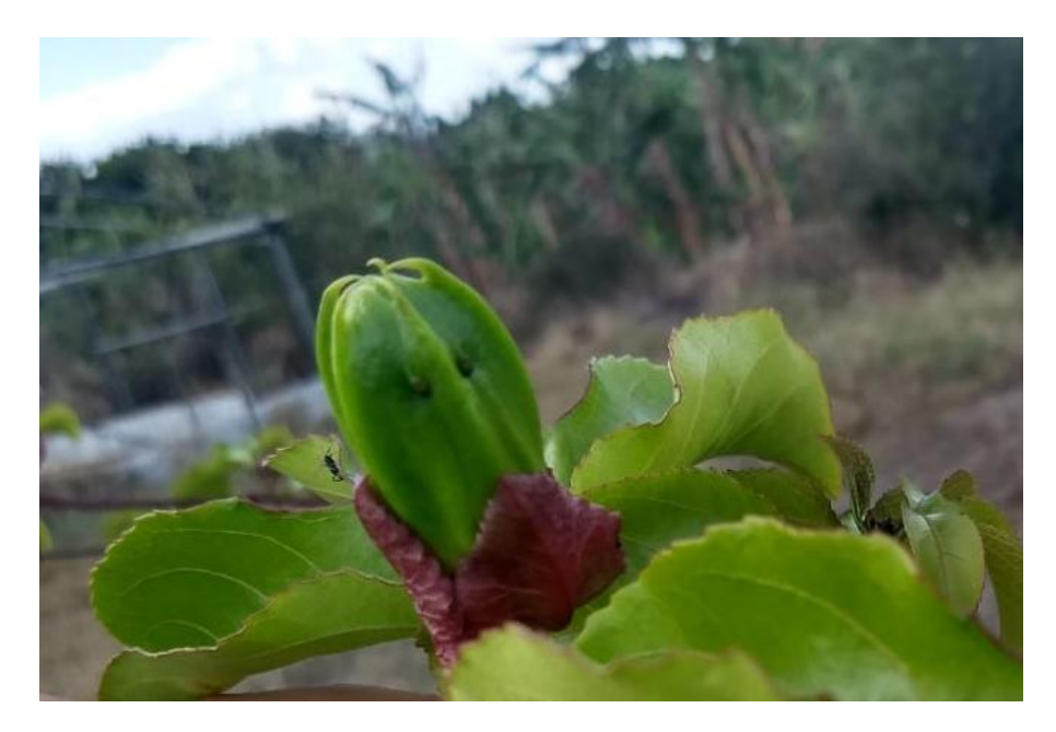
Fig. 1. Floral bud of Passiflora edulis Sims

Ten flower buds were collected in March 2019 in the pre-anthesis period (before opening) at around 11am, one flower bud per plant, and then stored in 70% alcohol.